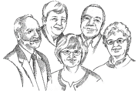
75 Plus Meeting

DATE: Thursday, June 6 th TIME: 6:30 PM PLACE: Chili's Restaurant, Monroe