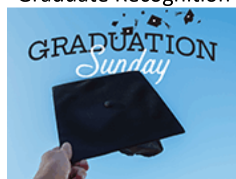
Sunday, June 5<sup>th</sup>

<u>Graduate Sunday 2022 - PHILADELPHIA BAPTIST</u> <u>CHURCH (pbcmarshville.org)</u>