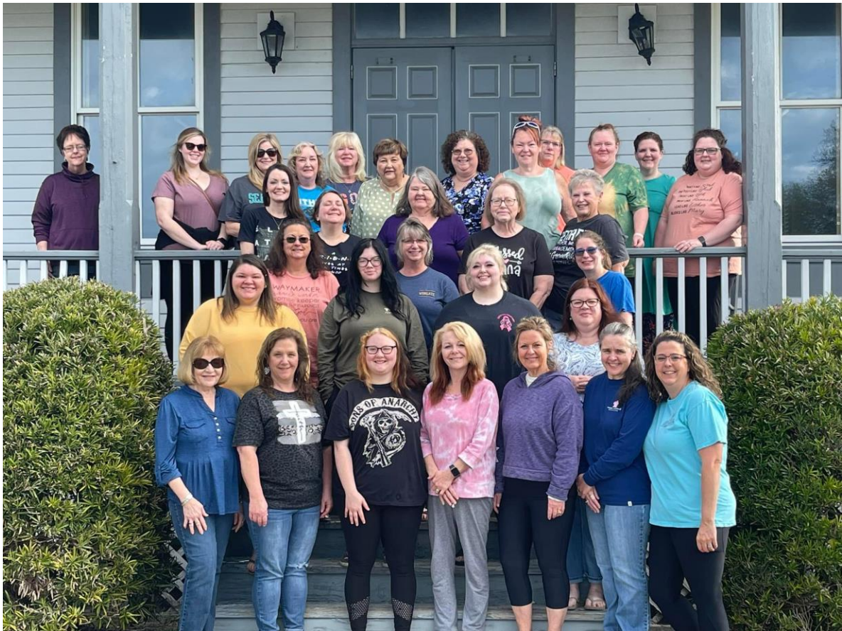
Ladies' Retreat 2022