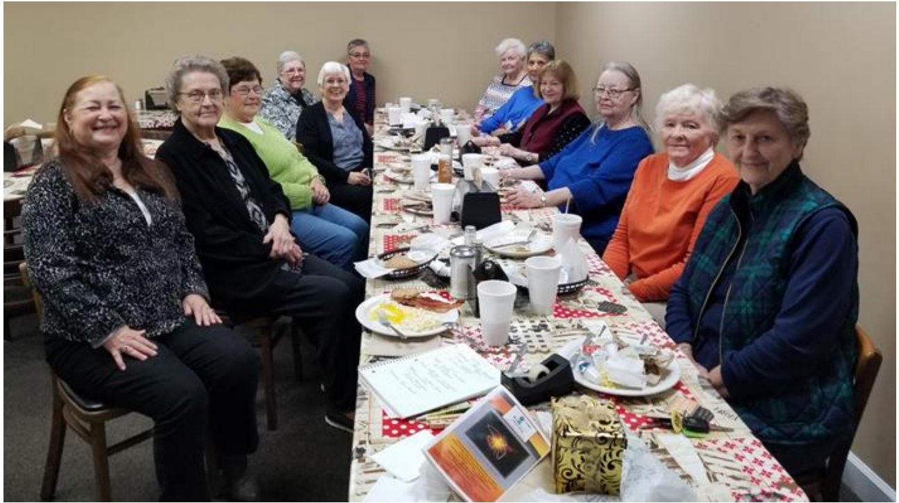
March 2022 Prayer Breakfast