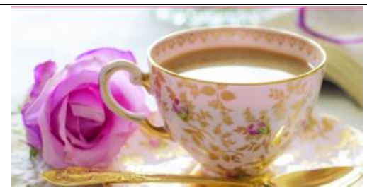
Ladies' Prayer Breakfast Tuesday, April 20th 9:00 AM Beth's Restaurant

If you would like to participate in our Graduate Sunday (Date TBA later), please go to: <a href="https://www.pbcmarshville.org/graduate-form/">https://www.pbcmarshville.org/graduate-form/</a> fill out and submit. Thank you.